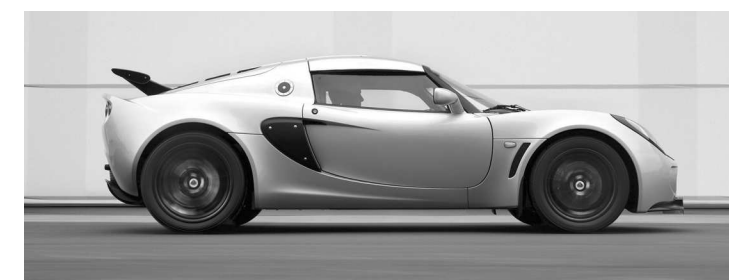
The Exige, not available in the US, not described in this newsletter

Here Comes the ABCs is available in stores now. Information on They Might Be Giants can be found at http://www.tmbg.com .