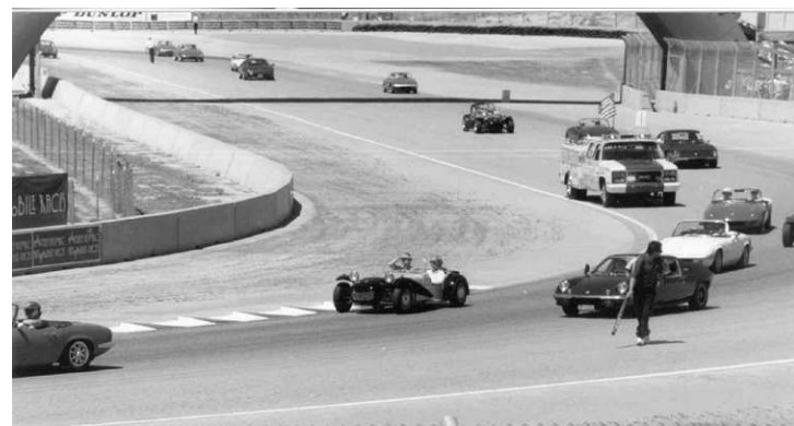
Photo 2 - 1995 Monterey Historics