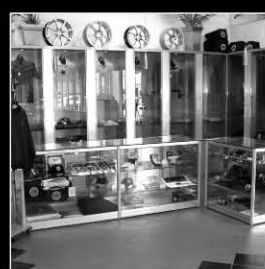
Onsite & Online Boutique