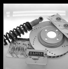
Complete Service & Parts Department