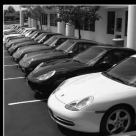
New, Used & Consignment Sales