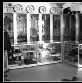
Onsite & Online Boutique