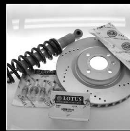
Complete Service & Parts Department