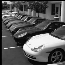
New, Used & Consignment Sales